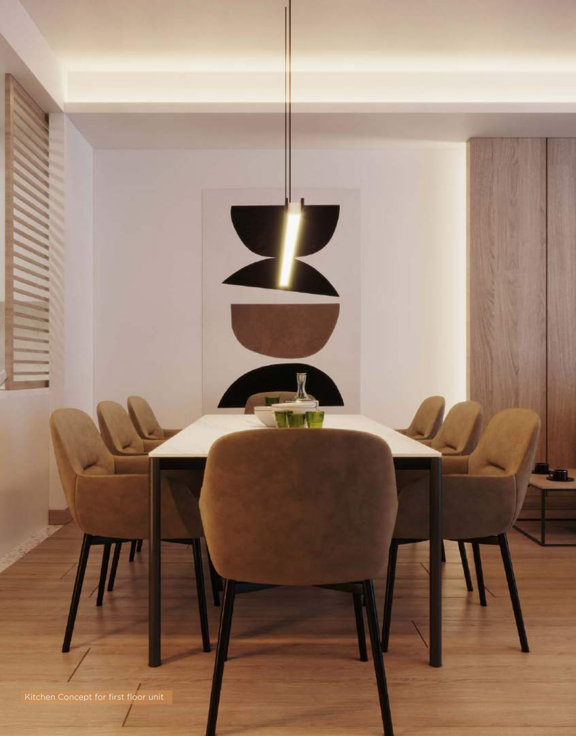
Kitchen Concept for first floor unit