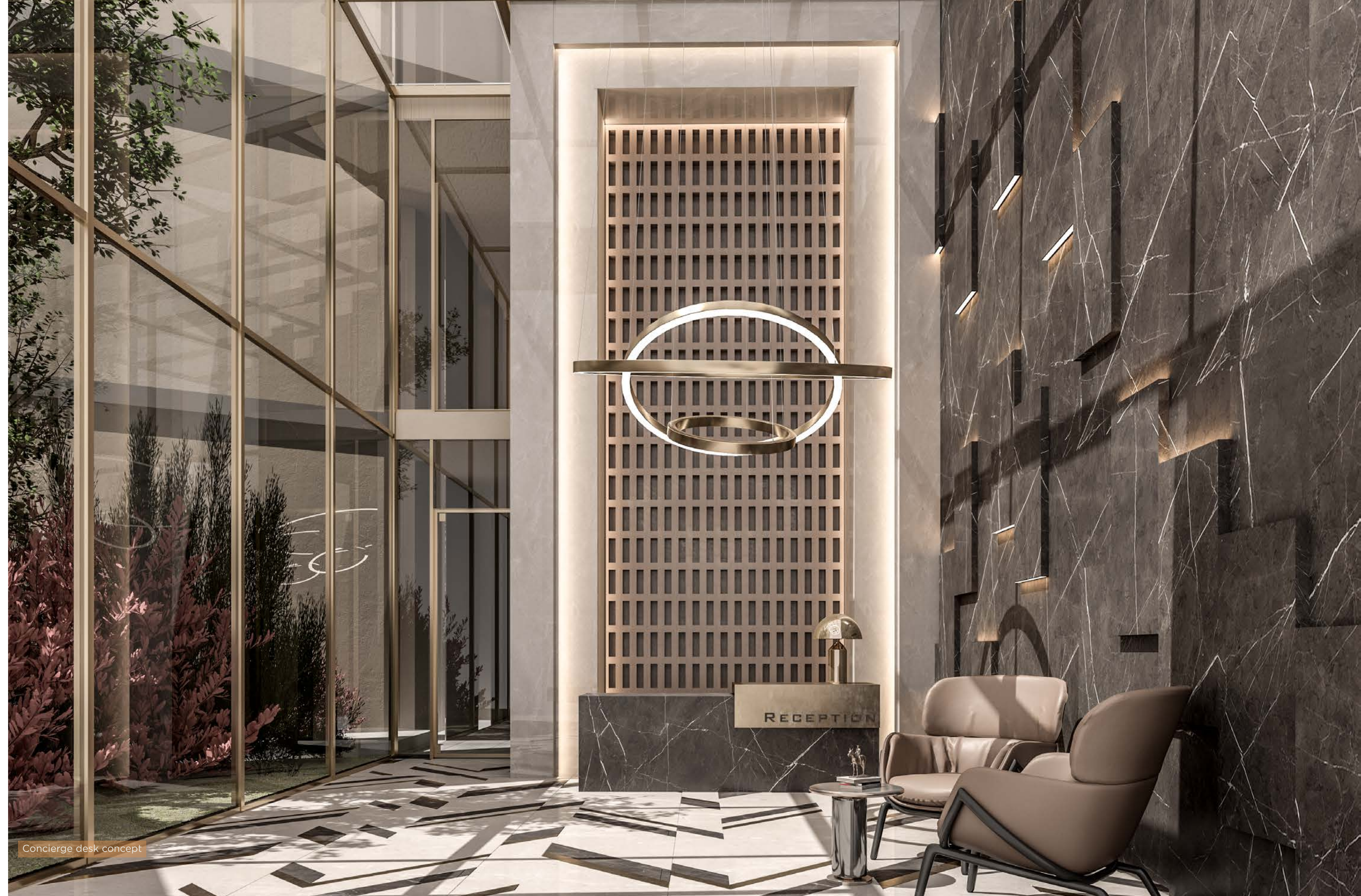
Concierge desk concept