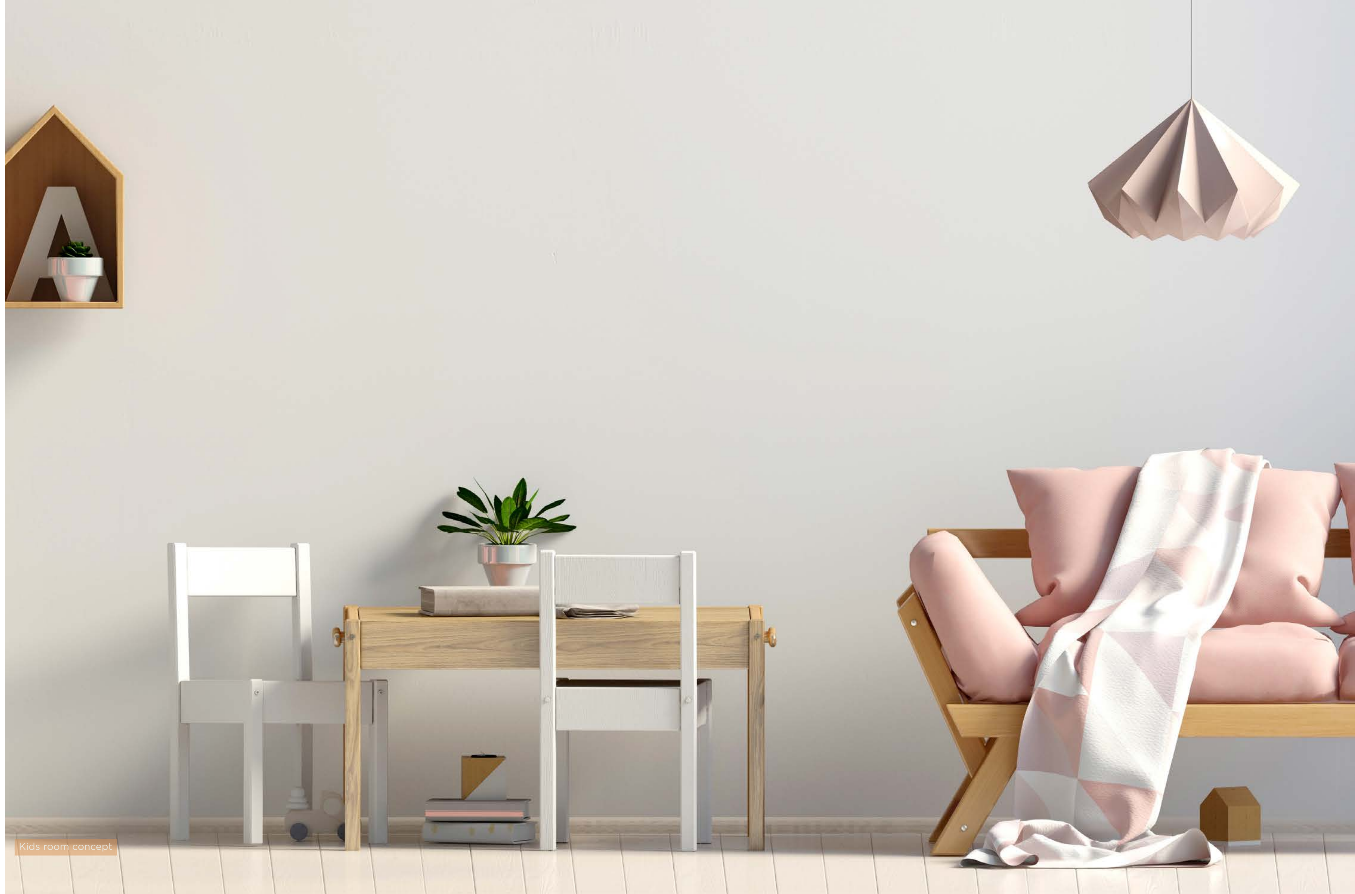
Kids room concept

Where Your Child Can Play, Without a Worry ~~~~~