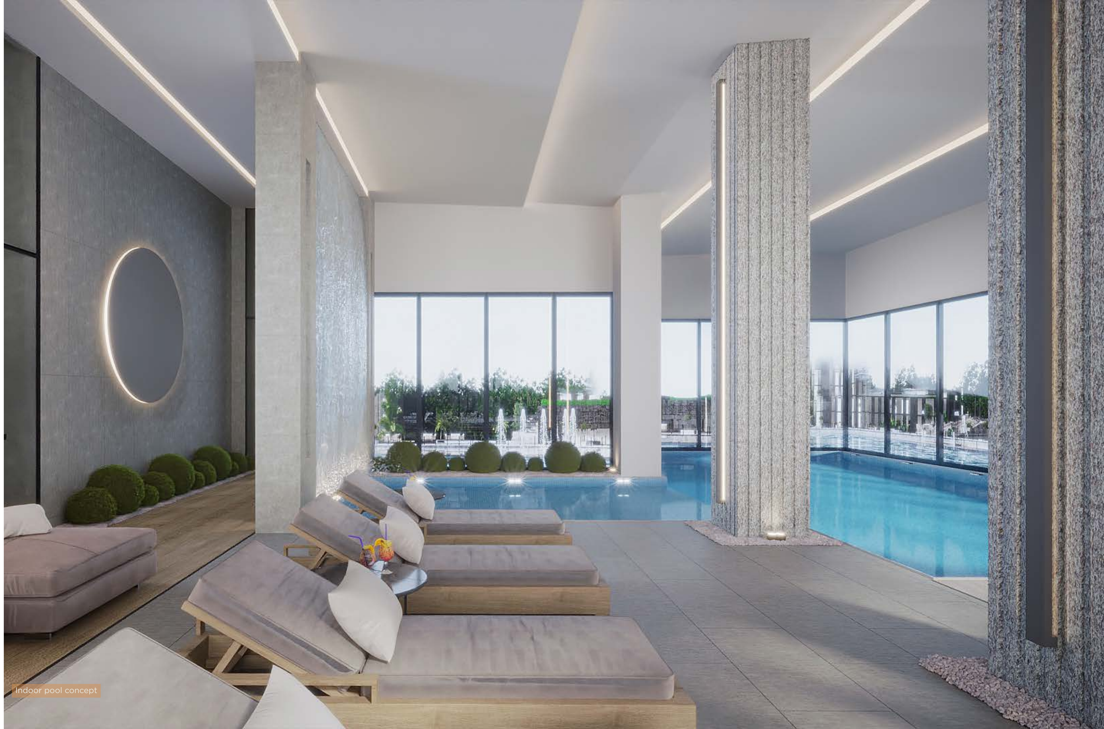
Indoor pool concept