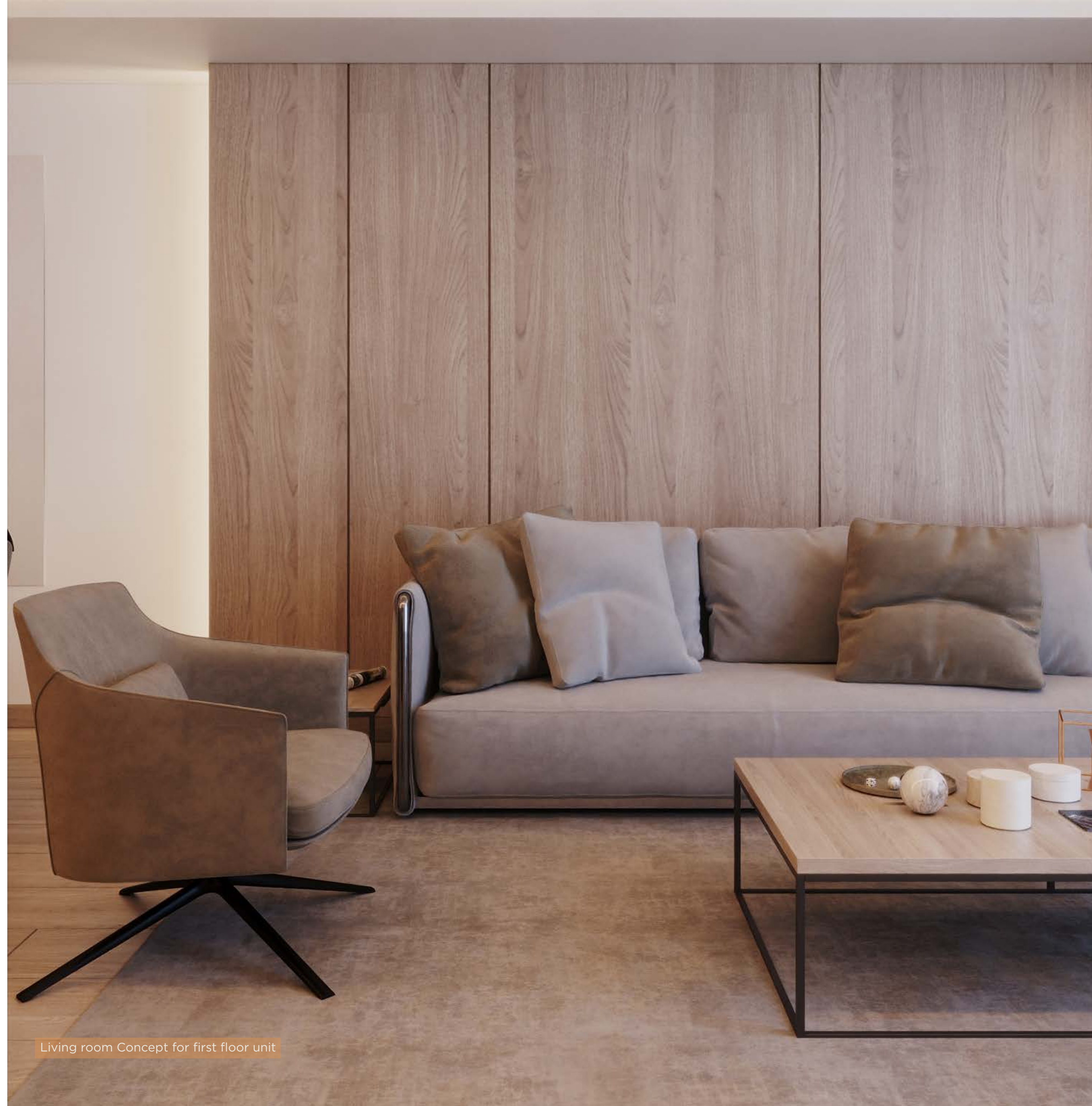
Living room Concept for first floor unit