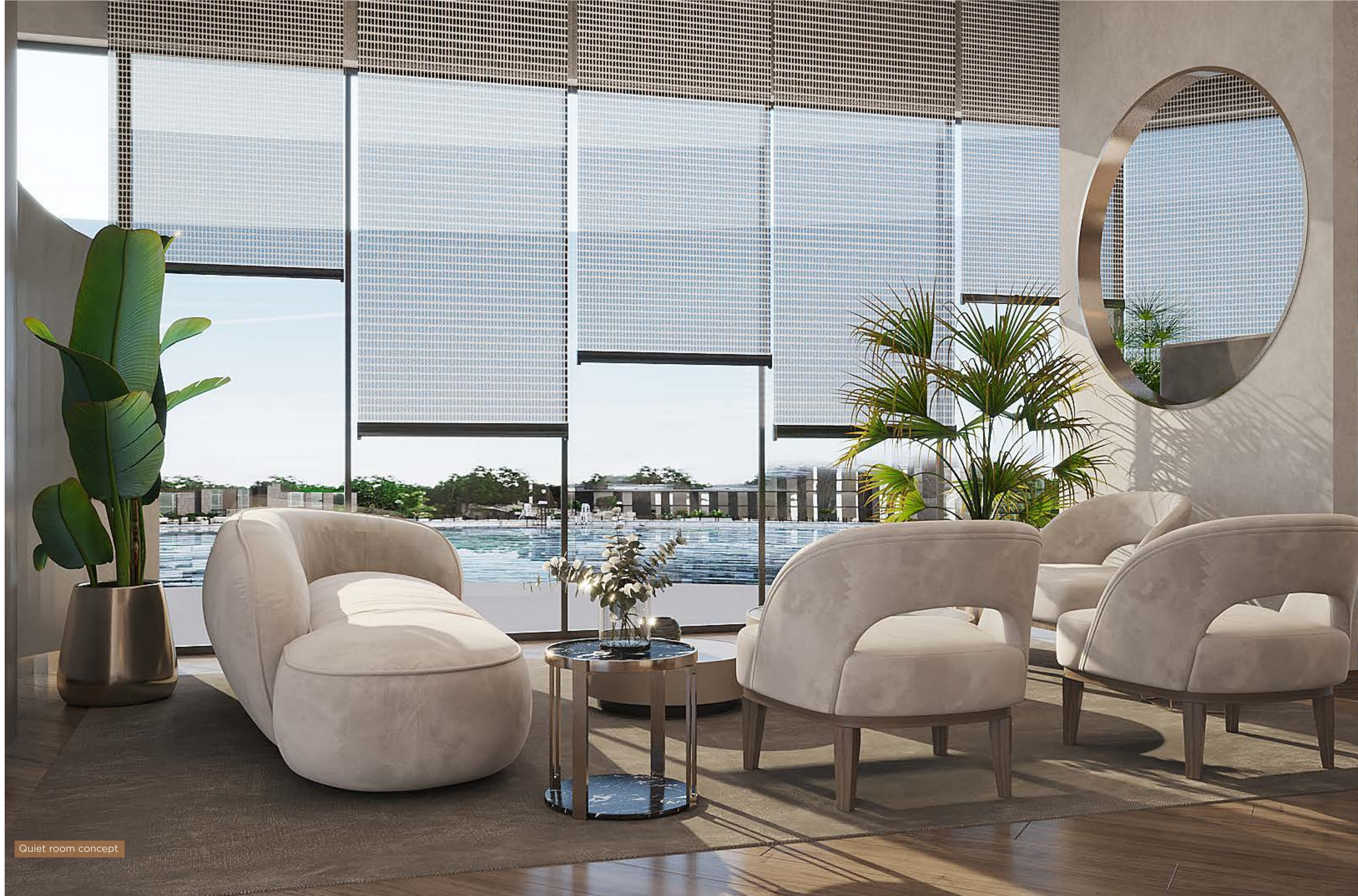
Quiet room concept